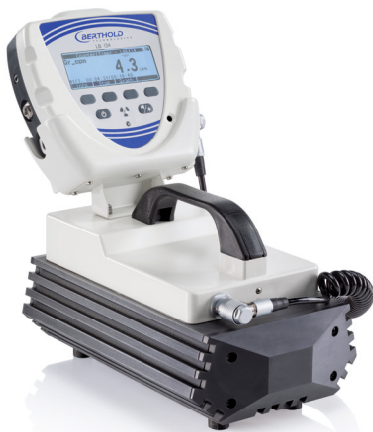
Figure 4: The LB 134 can be used as a portable neutron survey meter in combination with the LB 6414.