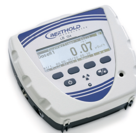
Figure 1: LB 134 UMo II base unit. Its software offers numerous measuring modes and parameter settings