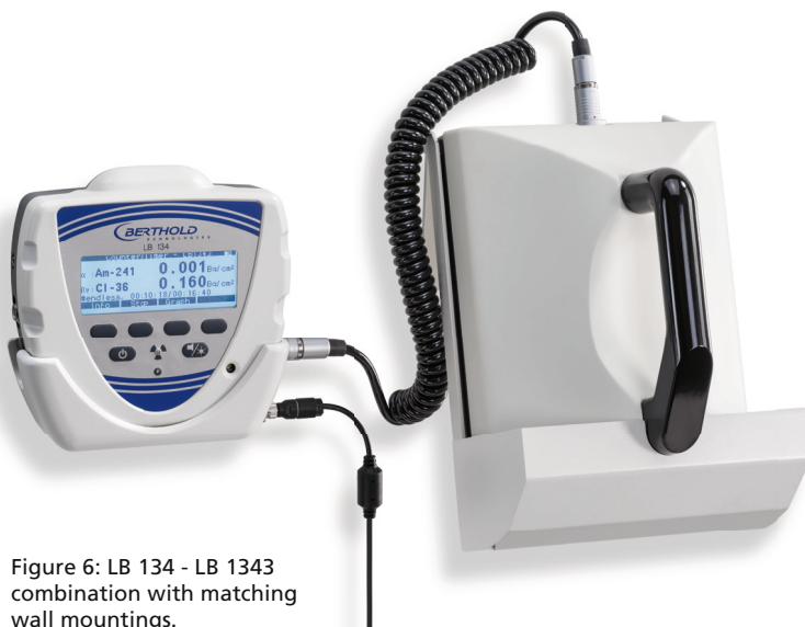
Figure 6: LB 134 - LB 1343 combination with matching wall mountings.

Explore our LB 134 measurement solutions