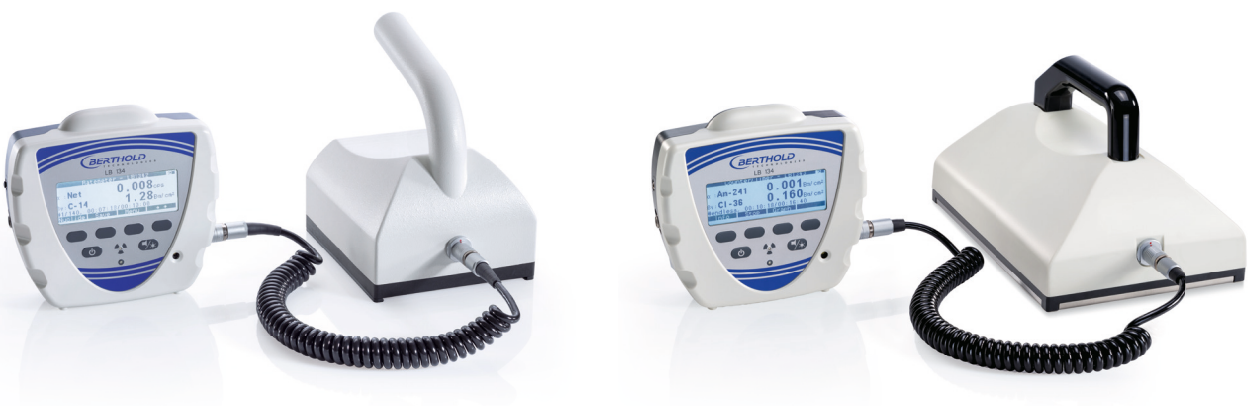
Figure 7: Two different scintillator probes are available: LB 1342 with 170 cm 2 area (left) and LB 1343 with 345 cm 2 area (right).