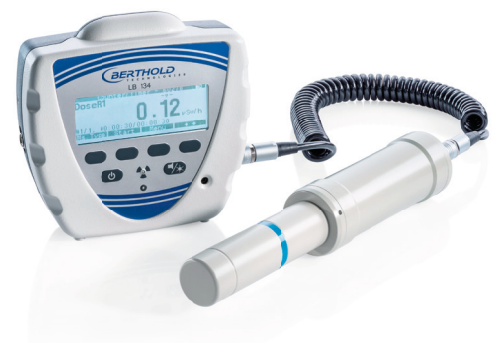
Figure 3: Portable combination of the LB 134 UMo II with the LB 1236-H10 gamma probe.