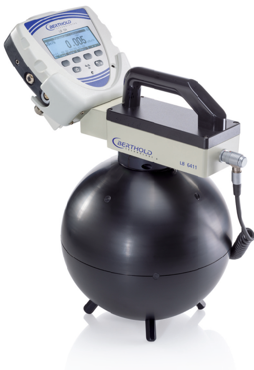
Figure 2: Mobile measurement setup of LB 134 UMo II connected to LB 6411 Neutron Dose Rate Probe.