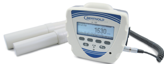
Figure 5: In combination with the LB 1234, the UMo II LB 134 offers a powerful mobile system for detecting radioactive gamma sources.