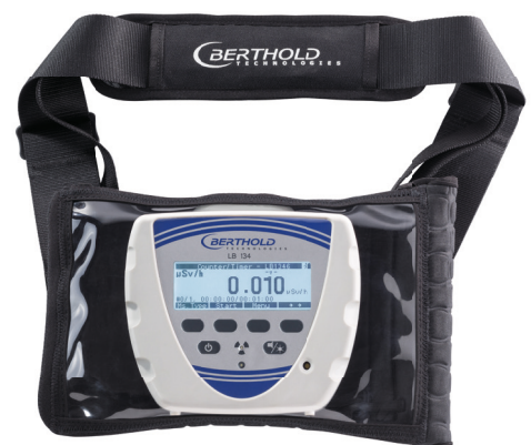
Figure 9: A practical bag with carrying strap is available for the LB 134.