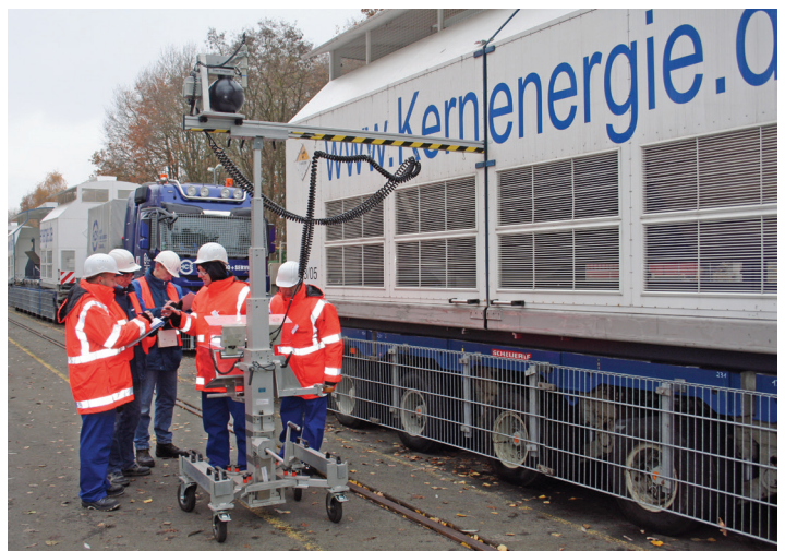
Figure 3: Neutron measurement during CASTOR transport

The LB 6411 operates virtually independent of the radiation direction. This is made possible by the optimized spherical geometry of the moderator and counter tube. In the energy range between 1 MeV and 20 MeV, it results in a directional deviation of less than \pm 10\% from the preferred direction over the entire angular range. In the lower hemisphere the directional dependence remains below 10% even at low neutron energies.