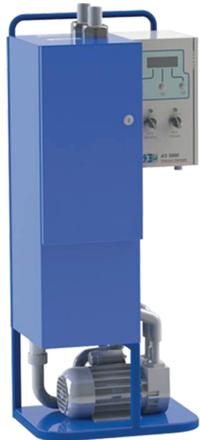
AS 5000 in stationary configuration