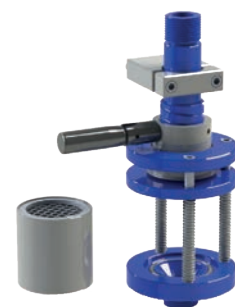
Filter holder TPHP (quick replacement of filters)

A simple rotational movement of the handle releases the cartridge holder of filter paper holder without need of disconnecting it from air sampling circuit.