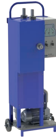
AS 5000 in mobile configuration